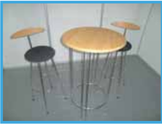
Code - 05