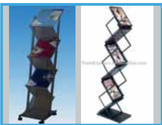
Code - 13