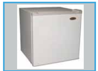
Code - 16