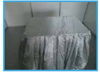
Code - 04