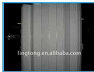
Code - 15