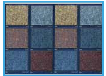
Code - 12