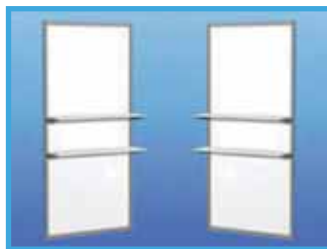
Code - 14