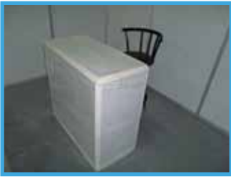
Code - 01