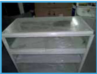
Code - 09