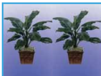
Code - 18