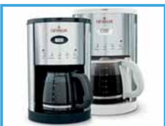
Code - 17