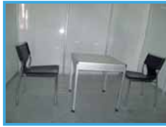
Code - 02