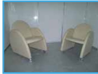
Code - 07