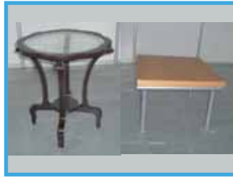
Code - 06