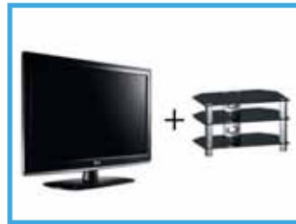
Code - 11