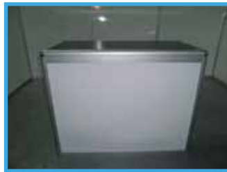
Code - 10