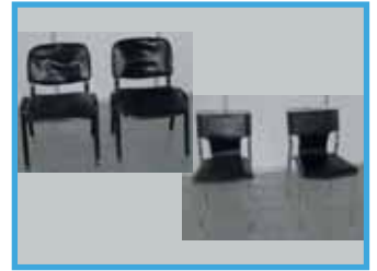
Code - 08