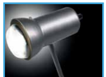
Code - 20