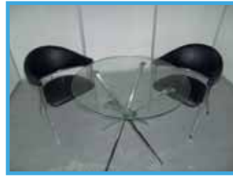
Code - 03